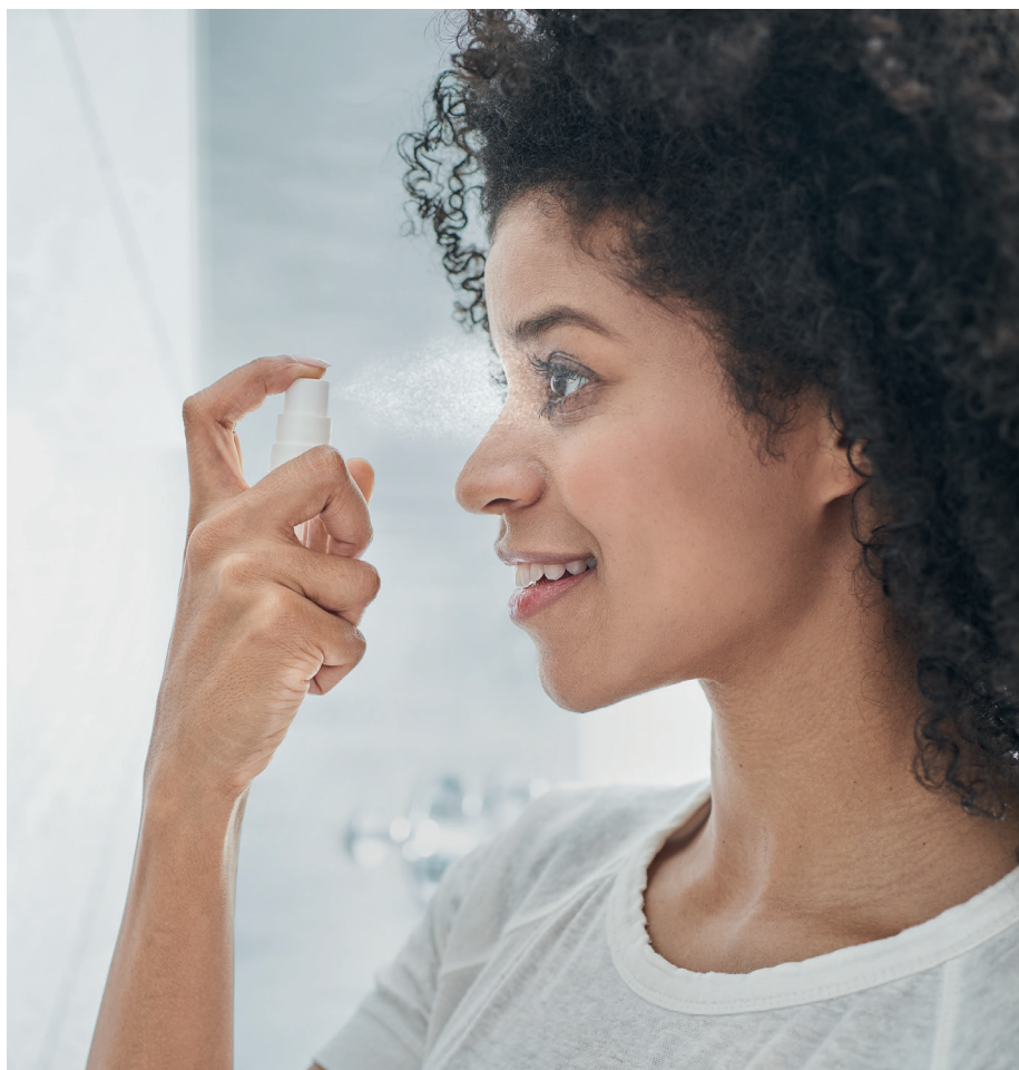
Figure 1: The eye spray targeting the open eye without blink reflex.

nozzle that creates an ultra-soft, slow-moving fine mist by microdiffusion. The horizontal pump is designed to release the aqueous formulation first after a defined pressure. Then the liquid is accelerated and pushed through a tiny spray nozzle unit (SNU), developed by Medspray. The SNU (shown in Figure 2 positioned on the head of a match for scale) is composed of multiple micro-holes. In comparison, existing eye sprays only have an insert with just one output.