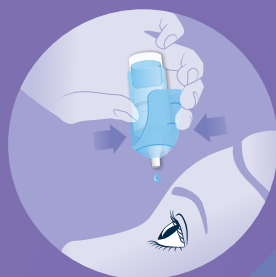
Side Actuation Device